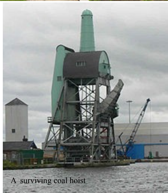
A surviving coal hoist

The Tom Puddings were floating coal containers that were then coupled together into a long train and towed by barge down the river to unloading points such as at Ferrybridge Power Station and Goole Docks.